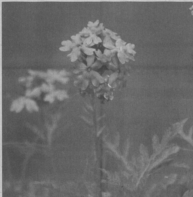
Above is an example of one of the many photographs on the Blinn Online Database.

The Blinn College Herbarium is accessible at http://www.blinn.edu/natscience/herbarium/index.html .